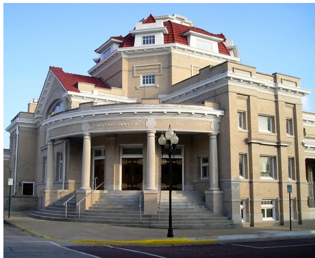
FIRST CHRISTIAN CHURCH